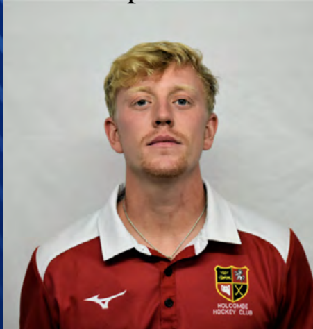
10. Jake Owen