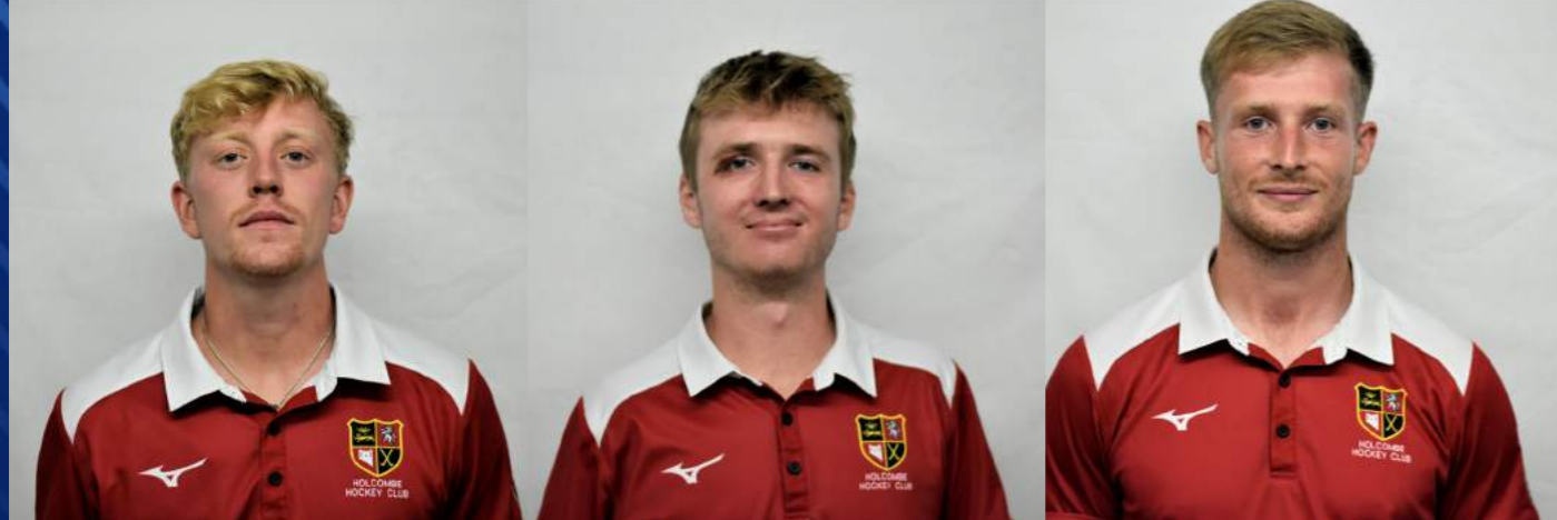
10. Jake Owen